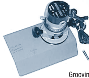
Grooving Jig with Router